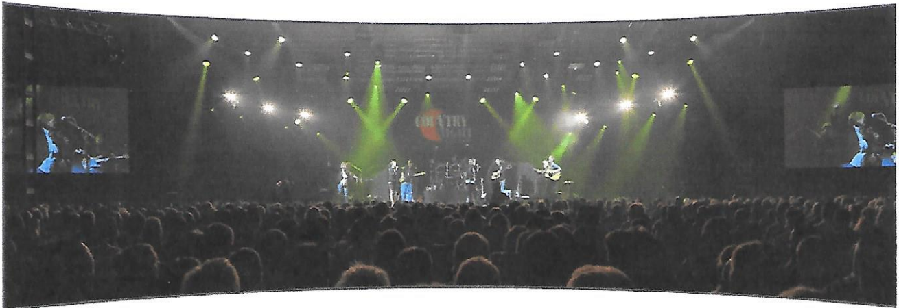
28th Country Night Gstaad 9th/10th September 2016